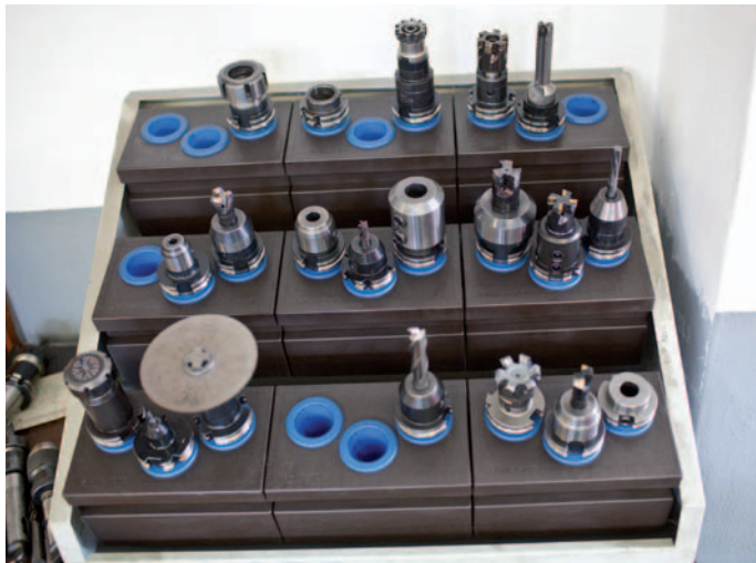
The tools and tool-holders for the MAXXMILL 500 provide users such as HABICHT with a degree of flexibility and operator convenience.

Five sides without changing setups – a capability that unlocks economic and quality-related advantages, especially for mid-sized companies. Small and medium production runs, ideally between 15 and 300 pieces, can be produced on this machine efficiently and at high quality. The tool magazine holds 30 tool stations ready for use.