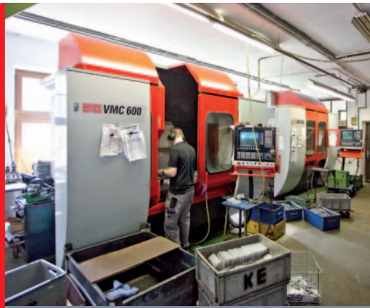
The metal specialists at HABICHT Herbert Eigentler place their trust in machines and services from EMCO.

When used in combination with a broad range of options that are used based on requirements, the compact, high-performance MAXXMILL 500 enables our customers to respond to new orders quickly and efficiently.